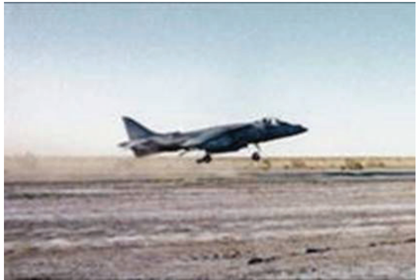
Military Operation Fields, Roads and Aircraft Landing Strips and Pads