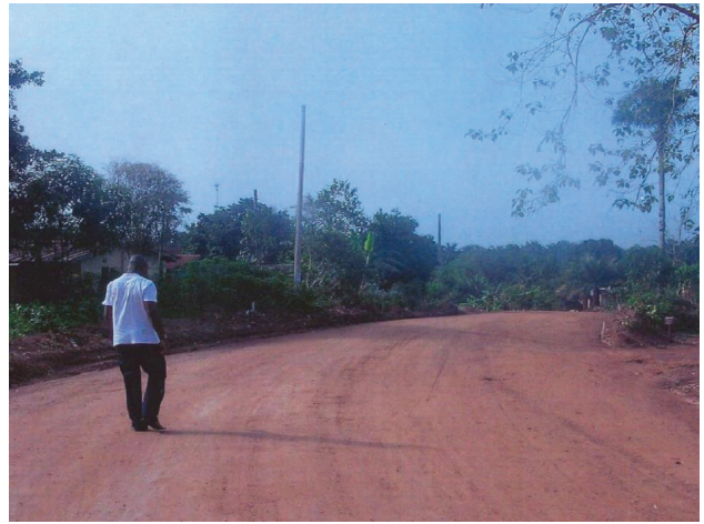
Village road modernized through mixed in application